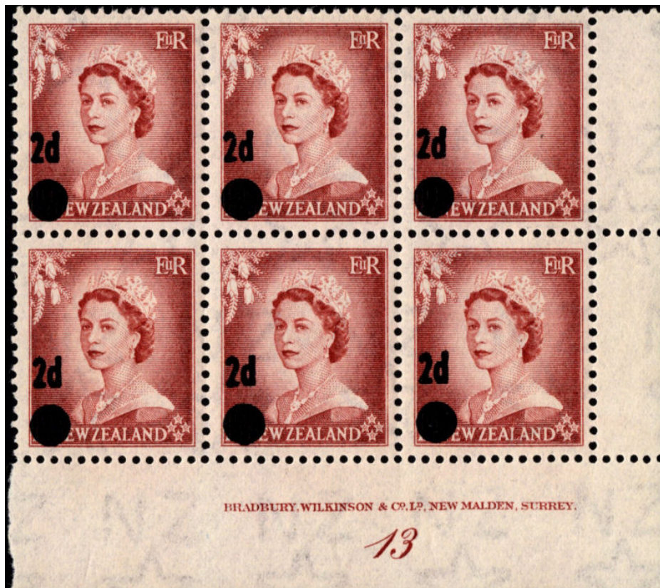
Plate 13 "Stars"

In 1958 a change in postal rates made the 1½d superfluous and put an increase on demand for 2d stamps. Rather than waste existing stocks of the 1½d, it was decided that this issue would be converted to 2d by means of an overprint surcharge. All existing stock of the redrawn stamp were retrieved from the central GPO and sent to the printers. At the same time all existing stock was recalled from other Post Offices. Amongst the returned stock were approximately 60 sheets of the original printing with the "stars" in the corner. These were subsequently overprinted along with the rest. The dot used in the overprint measured 4¼ mm, but eventually it wore out. A replacement dot measuring 3¾ mm was then used. How many of this smaller dot that made it onto the original "stars" sheets is unknown, but at least 12 individual examples have been seen. Plate numbers 7, 8, 9 & 10 were used for the redrawn version, with Plate number 13 the only one for the "stars" version. Copies with a forged surcharge on the "stars" version are known to exist.