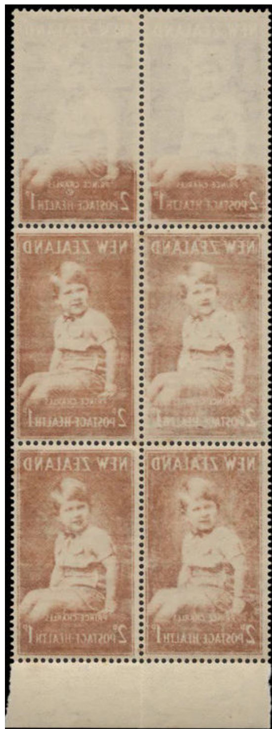
Complete Chocolate Offset

The 1½d Princess Anne, Pale Claret, is also known with complete offset.