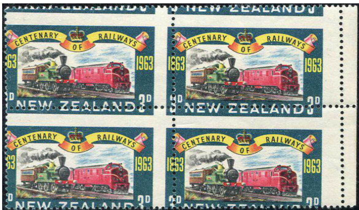
Major perforation shift